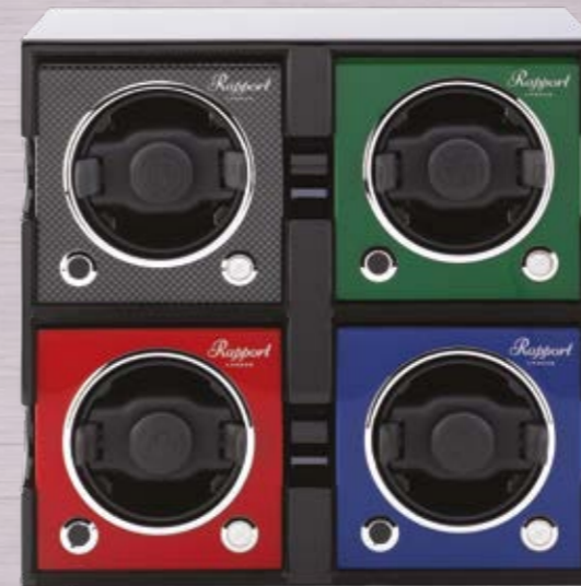
evo Quad box MKII SIZE: 280 X 280 X 150MM

Also available are double and quad cases, constructed in gloss finish Ebony, into which you can slot individual evocube MKII watch winders in any combination of colours you desire. Each compartment is lined with leather to allow a snug, scratch-proof fit of the units. These cases are wired to allow operation of all winders with a single electric adapter.