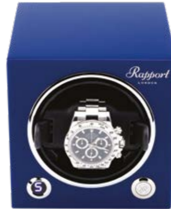
EVO22 Admiral Blue