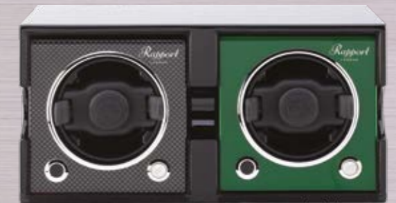
evo Double box MKII SIZE: 140 X 280 X 150MM

FRO44 - Box to take Four Single Watch Winders