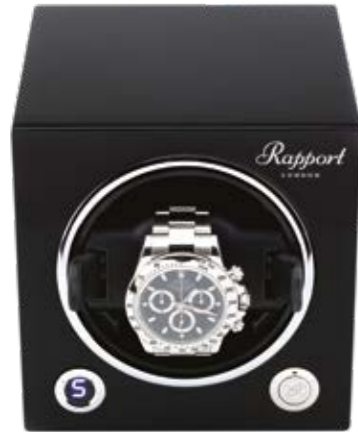
EVO20 Midnight Black

A NEW GENERATION OF ELECTRONIC WINDERS FOR PRESTIGE AUTOMATIC WATCHES SIZE: 120 X 120 X 146MM