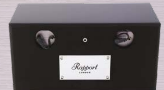
evo Double box REAR VIEW

FRO42 - Box to take Two Single Watch Winders