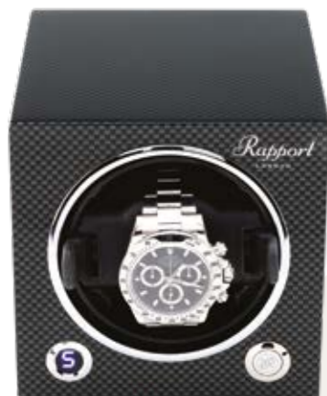
EVO30 Carbon Fibre