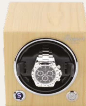
EVO32 Maple Wood