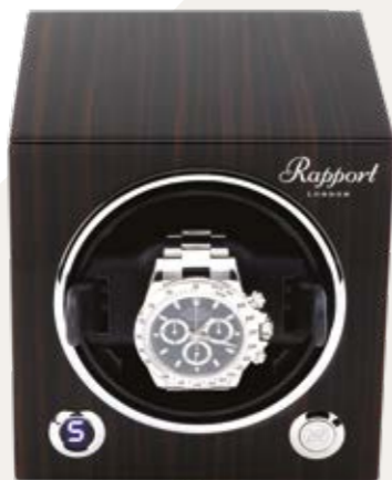
EVO31 Macassar Wood