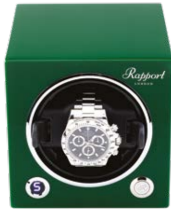
EVO24 Racing Green