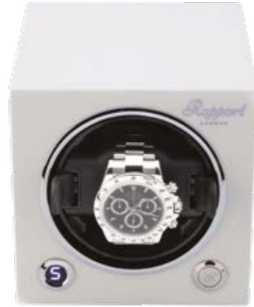
EVO21 Polar White