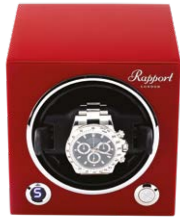
EVO23 Crimson Red