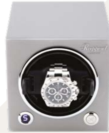
EVO25 Platinum Silver